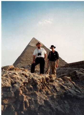
Pyramid of Giza 1995 1995