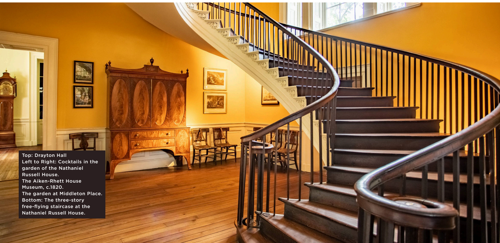
Top: Drayton Hall Left to Right: Cocktails in the garden of the Nathaniel Russell House. The Aiken-Rhett House Museum, c.1820. The garden at Middleton Place. Bottom: The three-story free-flying staircase at the Nathaniel Russell House.